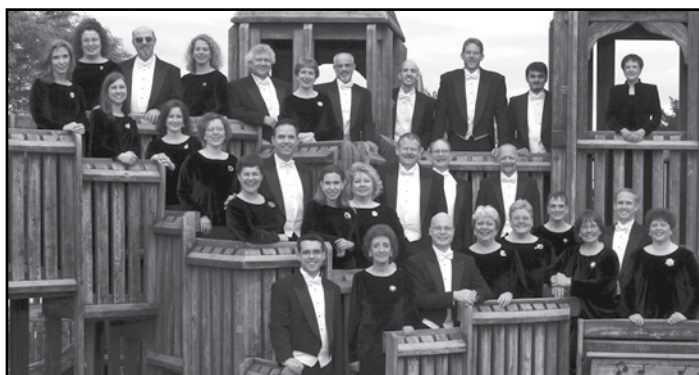
From top: Quintessentially Brass; Brandywine Harps; Susquehanna Chorale